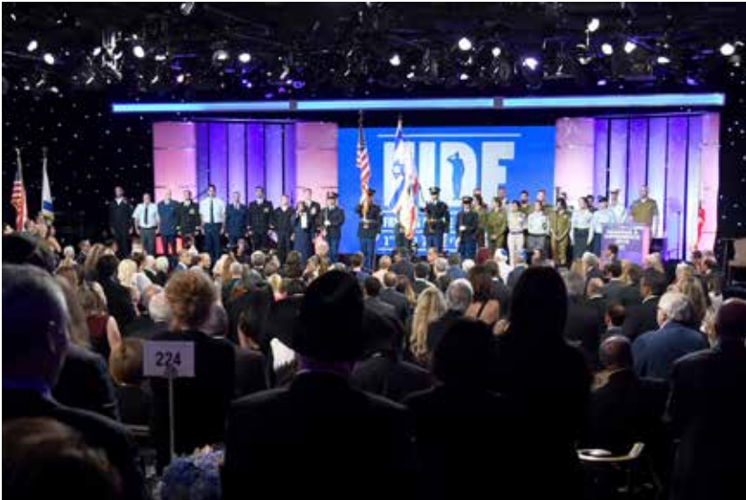
Friends of the IDF Western Region Gala, Beverly Hills, California, November 3, 2018.