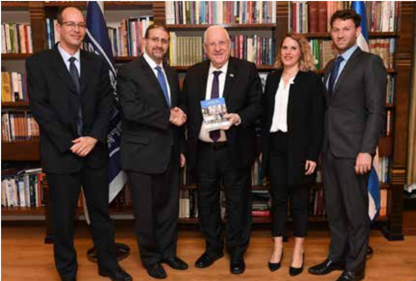
Israeli President Reuven Rivlin receives The American Jewish Community and Israel's National Security, prepared by INSS, in cooperation with the Ruderman Family Foundation.

Upon receiving the book, President Rivlin said: "I am pleased to receive this important study, particularly in the current crucial period for relations between Israel and world Jewry. I regard world Jewry